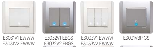
E3031V1 EWWW E3031V2 EWWW