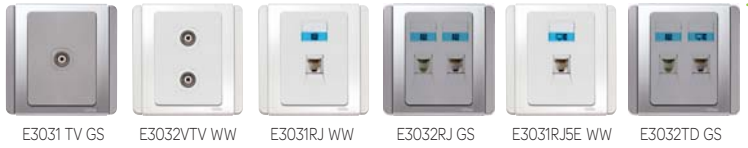
E3031 TV GS