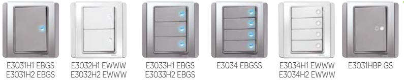
E3031H1 EBGS E3031H2 EBGS