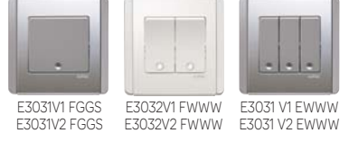
E3031V1 FGGS E3031V2 FGGS